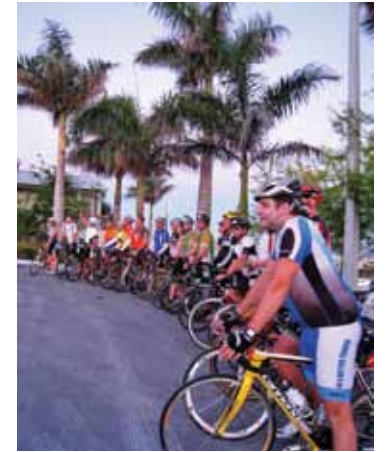
Cyclists came together to support literacy on April 2 at Lake Okeechobee for LOOP THE LAKE FOR LITERACY .