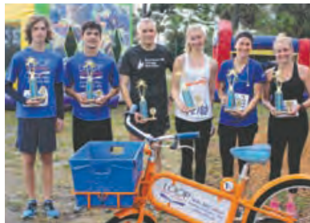
The winners of the men's and women's 5K Run.