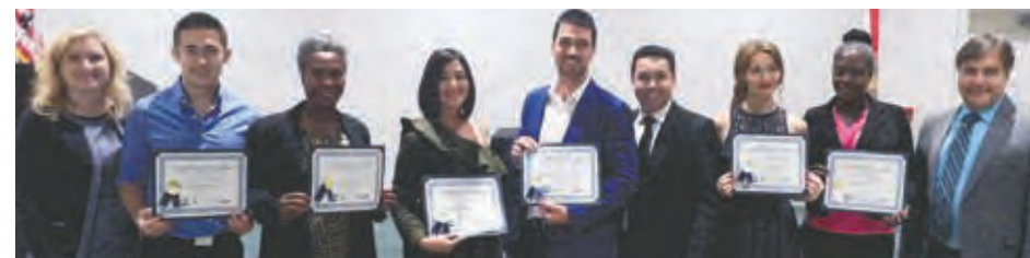
Students were recognized for their essays at this year's event.

"Write a letter to your younger self" was the theme for the Literacy Coalition's Adult Essay recognition initiative held in partnership with the School District of Palm Beach County's Adult & Community Education Department.