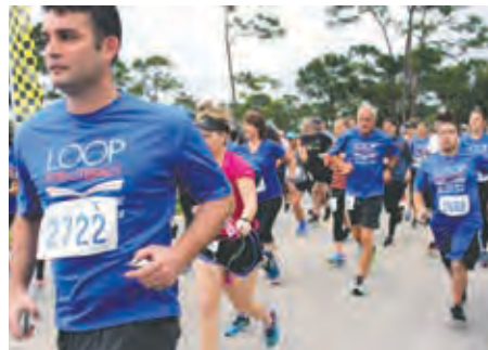
The participants at the start of the 5K event.

Proceeds supported vital literacy programs that assist children, adults and families in gaining reading and English skills that help them succeed in school and life.