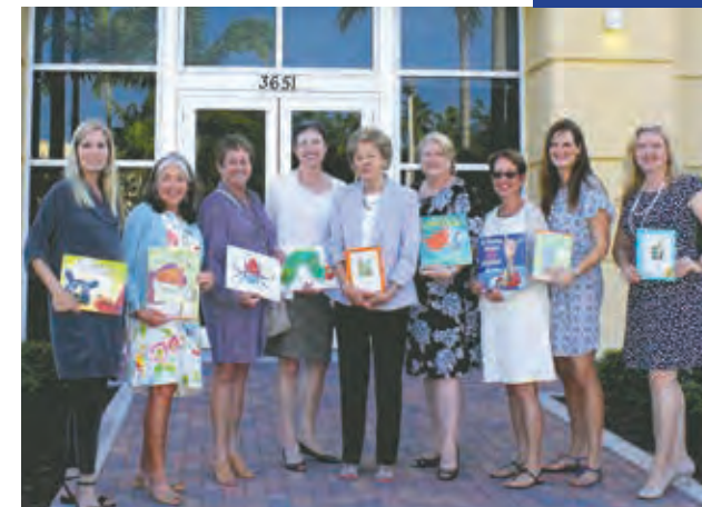
Donors celebrated at the 5 Year Anniversary of the Blume Literacy Center on June 20, 2018.

With 19 offices, conference rooms, a training room, a library and a book distribution center, the Literacy Coalition staff is flourishing in The Blume Literacy Center on the Brenda and C.P. Medore campus as we serve 27,000 adults, children and families throughout our county.