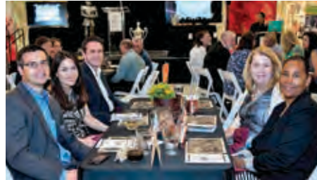
The Cozen O'Connor Team.