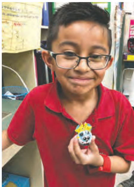
A student enrolled in Jupiter Elementary's 21st Century Community Learning Center (CCLC) program enjoyed programming Ozobots with After School Reads so much that he asked his mom to take him to the store to buy one with his birthday money so he could continue learning.

The ASR staff continued to represent the Literacy Coalition on a national level by presenting at the Beyond School Hours Conference, the National Afterschool Association Conference, the CASIS (Center