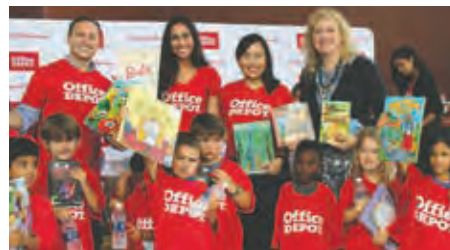
Thanks to Office Depot for their outstanding book donation.