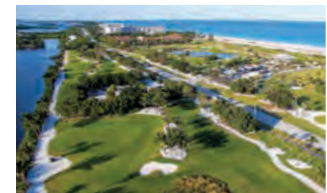
The Palm Beach Par 3 is located between the Atlantic Ocean and Intracoastal Waterway.