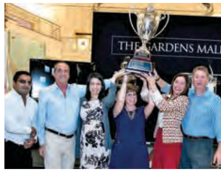
Akerman, LLP Team is the Grand Champion.