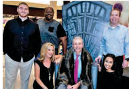
The WPBF 25 News Team upon the Throne.