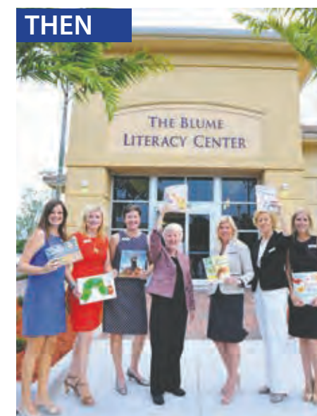
The Capital Campaign Committee at the Blume Literacy Center opening on June 20, 2013.