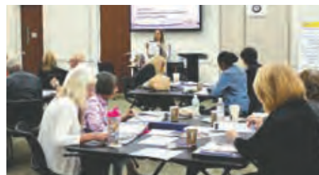
We are grateful to the hundreds of community members who attend our tutor trainings and give of their time to help us build better readers in our County.

All of this would not be possible without the members of our community who support our programs, initiatives and events to support our mission and vision. We recognize our many generous funders and partners in this report. Our impact and reach are increased with your help and we thank you. We also give special thanks to