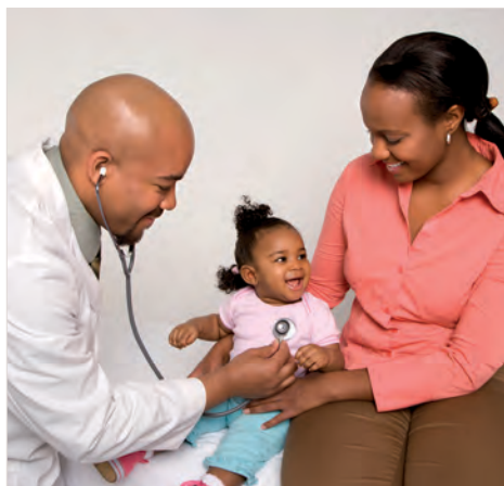
The Reach Out and Read program welcomes the Health Care District of Palm Beach County as its new partner in pediatric literacy at the four C.L. Brumback Primary Care Clinics.

The William R. Kenan, Jr. Charitable Trust has awarded a three year grant of $675,000 to expand Reach Out and Read in four states. The grant will provide new, developmentally-appropriate books and early literacy guidance during regular pediatric checkups to an additional 26,270 children living in poverty in North Carolina, Kentucky, New York and Palm Beach County, Florida. Locally, this grant will assist the Literacy Coalition in serving an additional 13,000 children over the next three years.