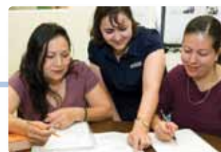
Connect adult learners with literacy programs