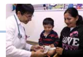
Introduce books to children through pediatric care