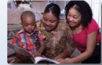
Strengthen parent-child verbal interactions