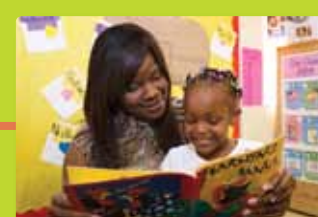
Develop school readiness skills