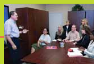
Train literacy professionals and volunteer tutors