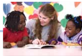
Make reading an integral part of children's lives