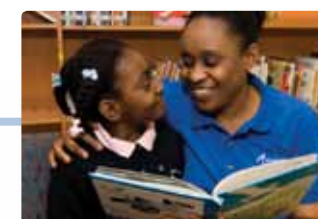
Build intergenerational literacy