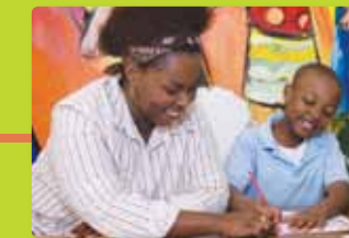
Tutor children after school