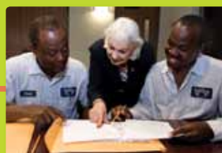
Improve job skills and opportunities