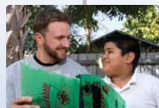
Create a community of readers