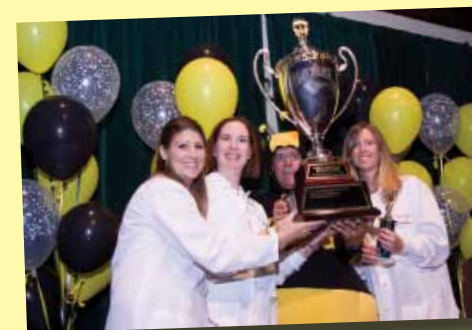
2011 1st Place Winner: Duffy's Sports Grill fielded by Scripps Research Institute