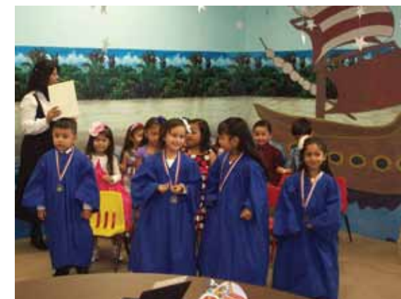
Parents, children and staff celebrated a most successful year preparing the four old children for kindergarten at the recent graduation festivities at the Coalition's Glades Family Education Program.