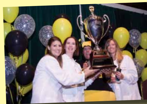
2011 1st Place Winner: Duffy's Sports Grill fielded by Scripps Research Institute

Register today at www.LoopTheLakeForLiteracy.org .