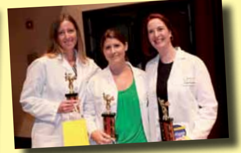
2nd Place: Duffy's Sports Grill fielded by Scripps Research Institute