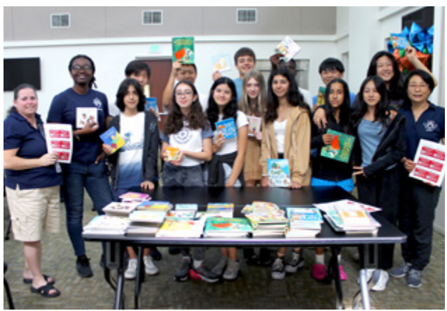
Students from American Heritage School helped label books. 6 Literacy Coalition of Palm Beach County

To see a complete list of volunteer opportunities, visit LiteracyPBC.org