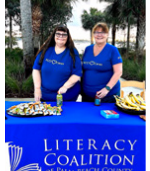
NCCI employees volunteered at LOOP for Literacy.