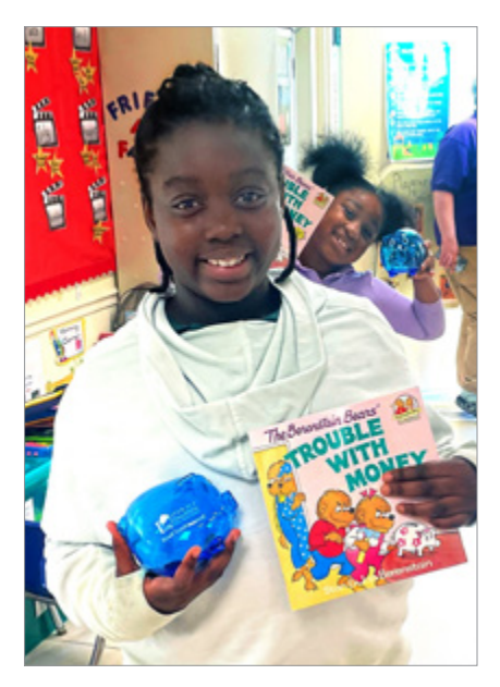
Youth learn important life skills such as money management and self-regulation.

973 children received direct instruction.