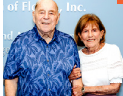
ortin Foundation of