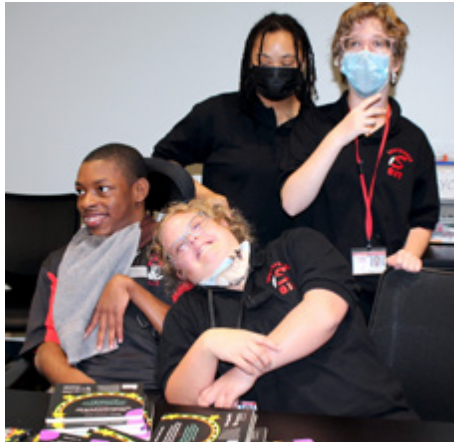
Santaluces students with On-The-Job training