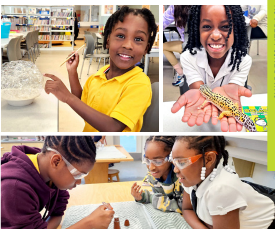
Students at Galaxy Elementary were excited to be hands-on in every activity and to take home new books.