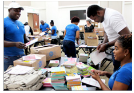
Employees from The Breakers volunteered to sort and label books for our Reach Out and Read program.