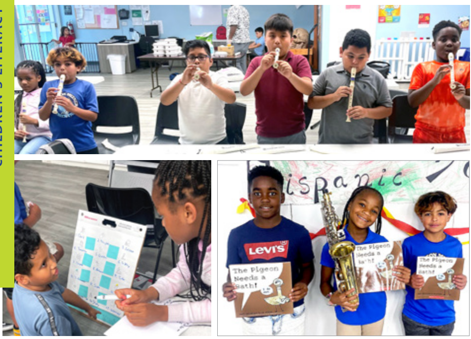
The Read! Lead! Succeed! program regularly integrates music into the lessons