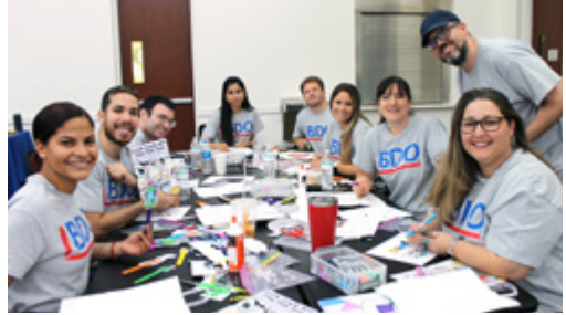
United Way Day of Action volunteers