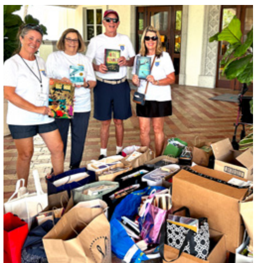
Mirasol Country Club Foundation collected and donated 1,100 books to the Coalition.