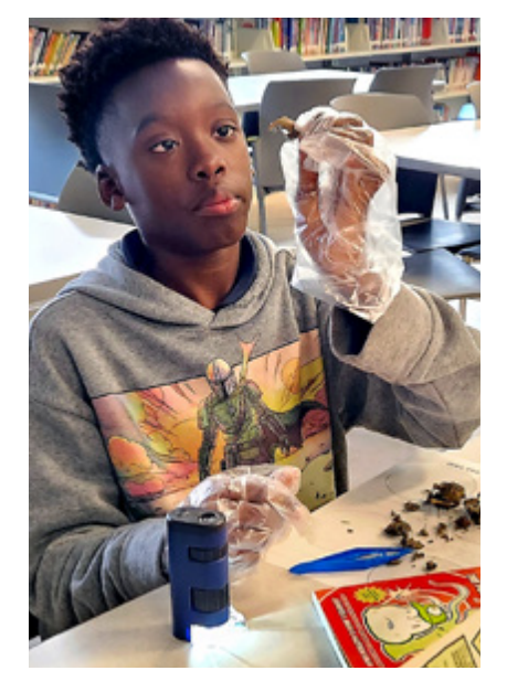
From microscopes to owl pellet dissections, all youth in the Stories and Stem program were able to share their discoveries.

273 interactive sessions were held at 17 sites.